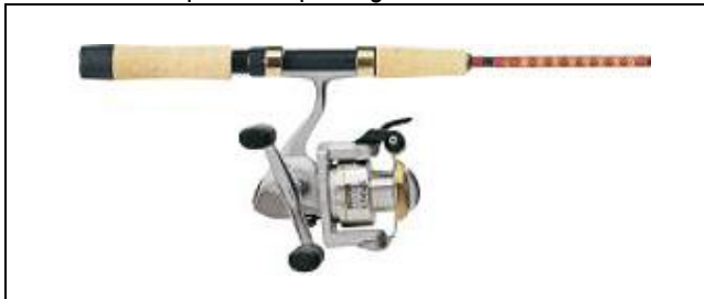
Example of a Spinning Rod & Reel